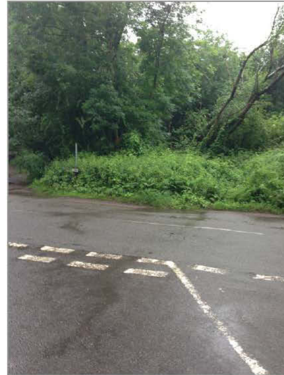
Location of previous sign (looking south from Nytimber)