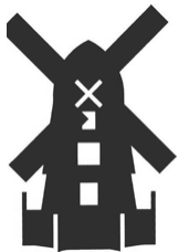
West Sussex Style (Cast Iron)