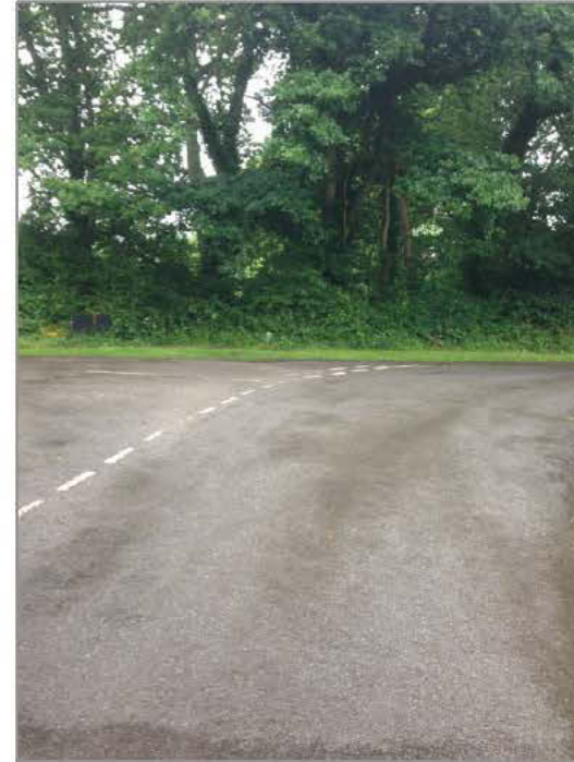
Location of previous sign (Looking East for Gay Street Ln)